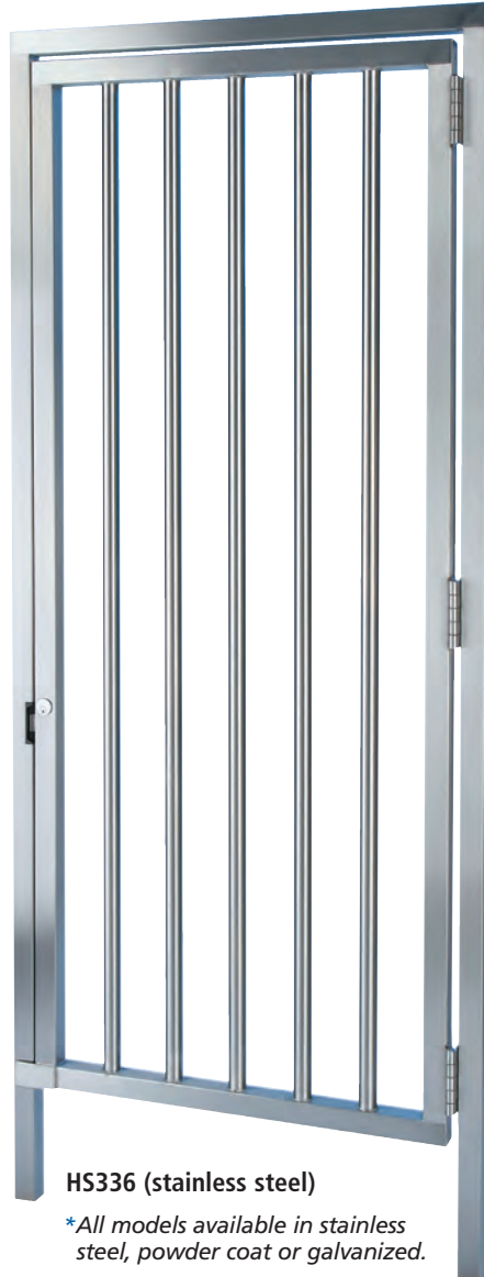
HS336 (stainless steel)

*All models available in stainless steel, powder coat or galvanized.