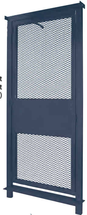
HS336 - Front (powder coat with mesh)

*All models available in stainless steel, powder coat or galvanized.