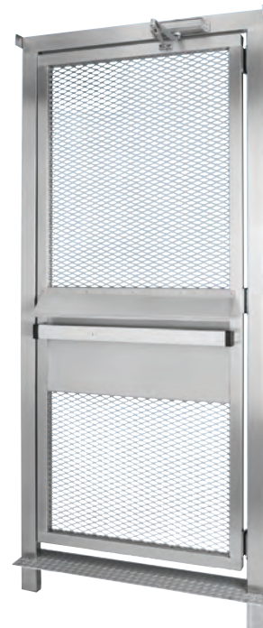
HS336 - Back (stainless steel with mesh)