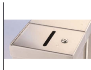
FP500-T (ticket box)